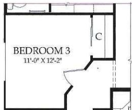
Optional Bedroom 3 in lieu of Den