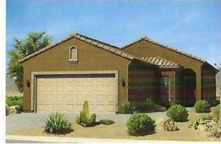
A - Spanish