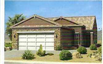
C - Desert Ranch