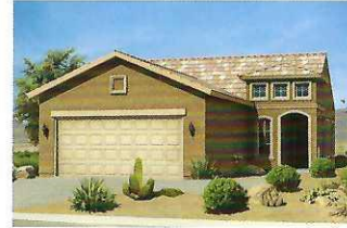
B - Tuscan