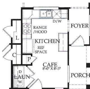
Porch at Elevation B